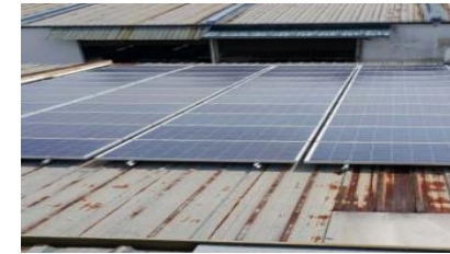
Sri Kembangan, 8.7 kWp