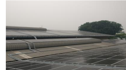
Top Glove F18, 1.12 MWp