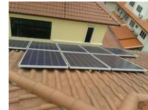
Cheras Hartamas KL, 4kWp